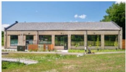
Top Projects of 2025: Urban Ecology Center – Prairie Springs on Park

The renovation of this 100-plus-year-old, 11,361-square-foot building into an event hall for Urban Ecology pre[...]