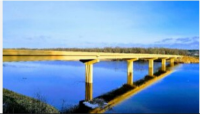
Top Projects of 2025: WIS 130-133 Bridge over Wisconsin River Design-Build

The WIS 130 Lone Rock Wisconsin River Bridges project replaced three structurally deficient, 80-plus-year-old [...]