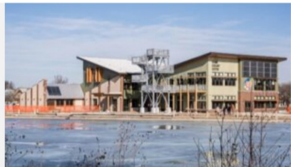
Top Projects of 2025: Urban Ecology Center – Washington Park

VJS Construction Services led the renovation and expansion of the Urban Ecology Center in Washington Park, a $[...]