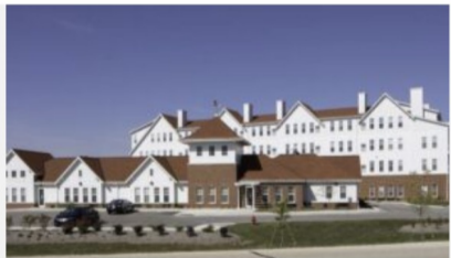
Top Projects of 2025: The Westerly Pewaukee

Moore Construction Services delivered The Westerly, a 138-unit senior living community spanning 193,082 square[...]