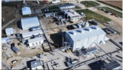
Top Projects of 2025: Wisconsin Reliability Project

The Wisconsin Reliability Project, completed by Michels Pipeline in partnership with TC Energy, represents a [...]