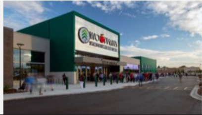
Top Projects of 2025: Woodman's Sports & Convention Center